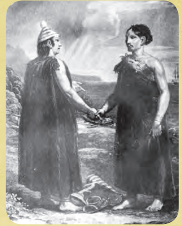
An engraving from the 1700s showing Nootka Chief Maguinna, who controlled the fur trade in Nootka Sound, trading with Chief Callicum. Traded goods lie at their feet.

The Old North Trail asked a lot of every traveler. You had to be nimble because it ran across stony riverbeds and around buttes so high you could barely see the top. You