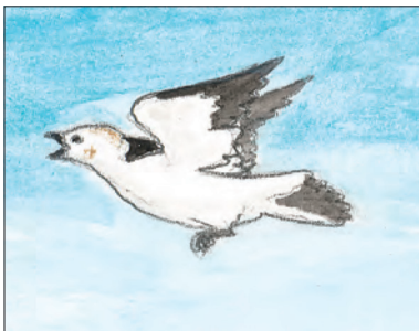
Qupanuaq (Snow bunting)

The horned larks are brown birds with black cheeks.