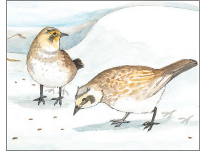
Kajuqtaat (Horned larks)

Canada geese fly south for the winter in the shape of a 'V'.